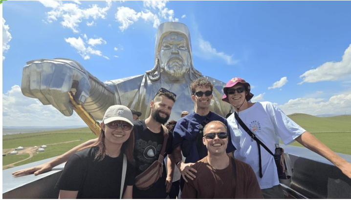
Image of the month: Projects Abroad participants pose in front of the Chinggis Khaan Equestrian Statue in Terelj National Park, Mongolia

This month, we bring you some exciting news: A new medical internship for teens just launched in Valencia, Spain.