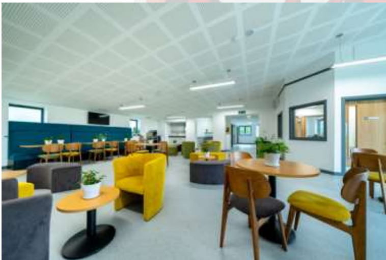
Below: Photos of some of the new Sixth Form building spaces